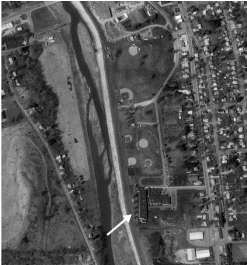
Aerial View of Warren L. Miller Elementary School

2001 Mansfield, PA Quadrangle . 7.5 minute series. Topography compiled b 1999. Planimetry derived from imagery taken 1999 and other sources. Survey control current as of 1954. Boundaries current as of 2001. Denver, CO.